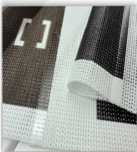
PVC Mesh: Overlap & Hem